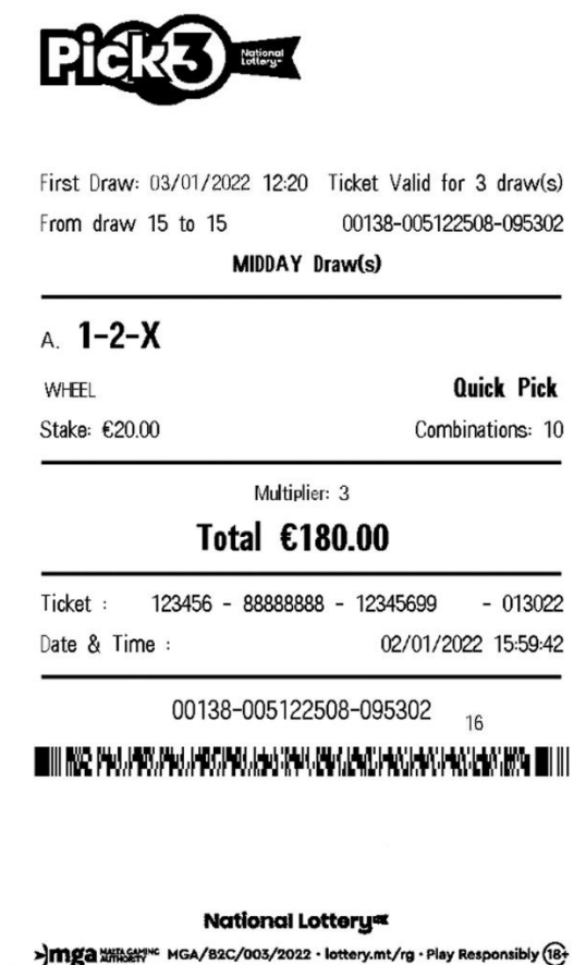
Figure 1; The Pick3 Ticket Receipt is indicative and subject to change

The ticket is the unique valid document for claiming winning prizes. The following is an illustration that represents a visual of the Pick3 ticket, including the information displayed on the ticket.