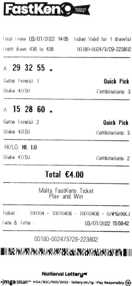
Figure 1: The indicative FastKeno Ticket Receipt

The ticket is the unique valid document for claiming winning prizes. The following is an illustration that represents a visual of the FastKeno ticket, including the information displayed on the ticket.